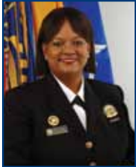
REGINA BENJAMIN MD, MBA, VADM United States Public Health Service Surgeon General (invited)

Prior to her appointment in 2009, Dr. Benjamin was a family doctor in the shrimping village of Bayou La Batre, Alabama. In 1990 she founded the Bayou La Batre Health Clinic and rebuilt it three times—once after Hurricane George in 1998, once after Hurricane Katrina in 2005, and later following a fire. Among her many honors Dr. Benjamin was a recipient of the John T. and Catherine D. MacArthur Foundation “Genius Grant,” and has served as a trustee of the American Medical Association. Her work with a diverse population that includes immigrants from Vietnam, Cambodia and Laos, as well as many residents lacking health insurance, makes her very well qualified for the post of U.S. Surgeon General.